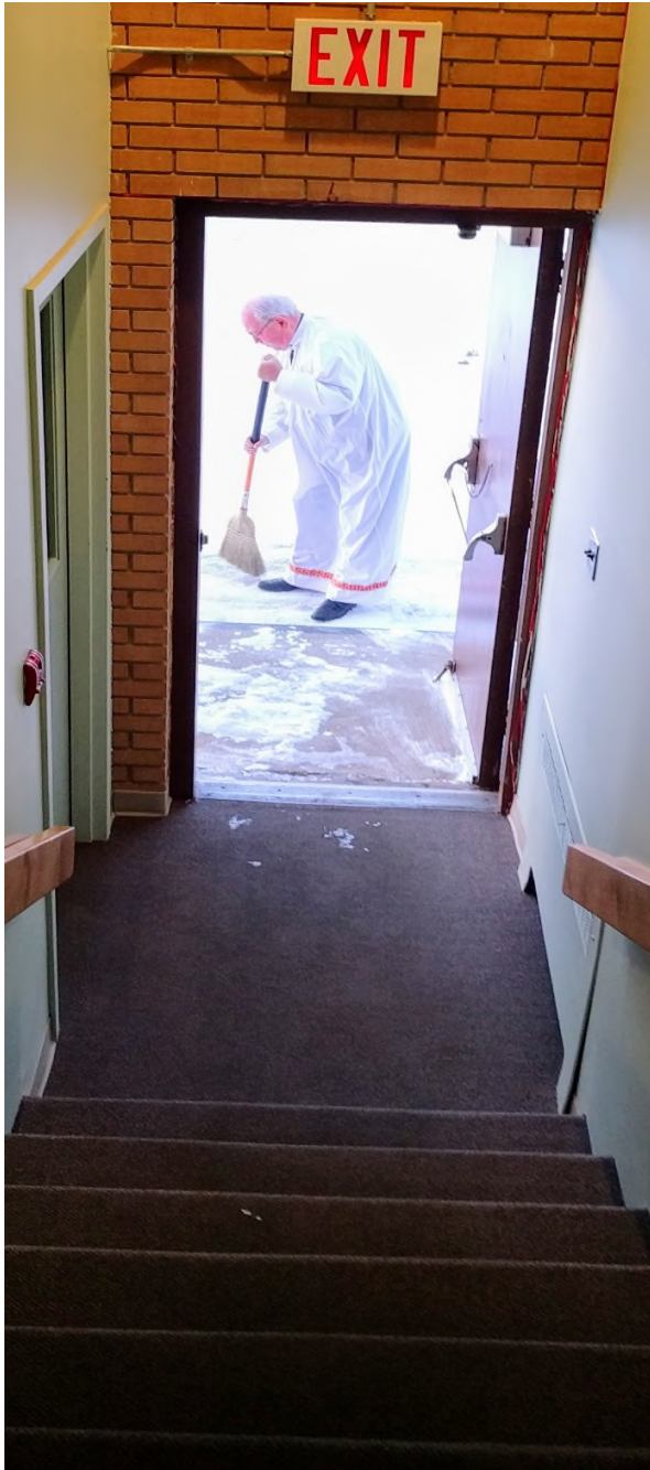
Our Deacon Doing Double Duty.